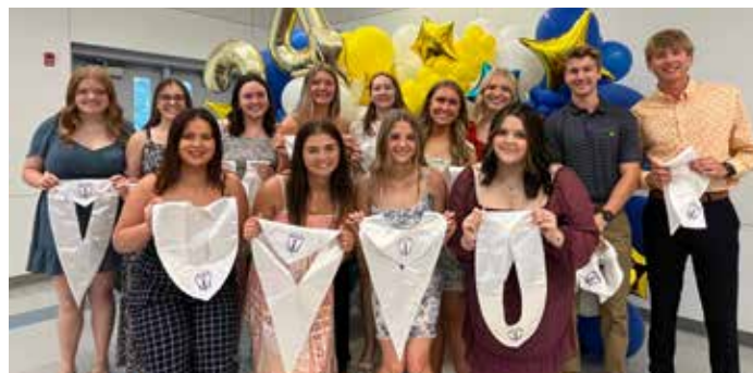
2023-2024 PBL National Honor Society Seniors

Direct all questions to 217.379.4715 or secretary@pblfoundation.org